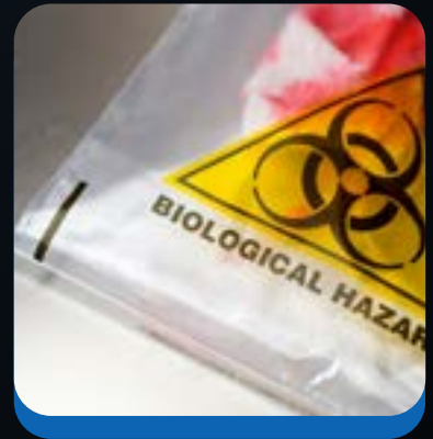
Hazardous Material Spill